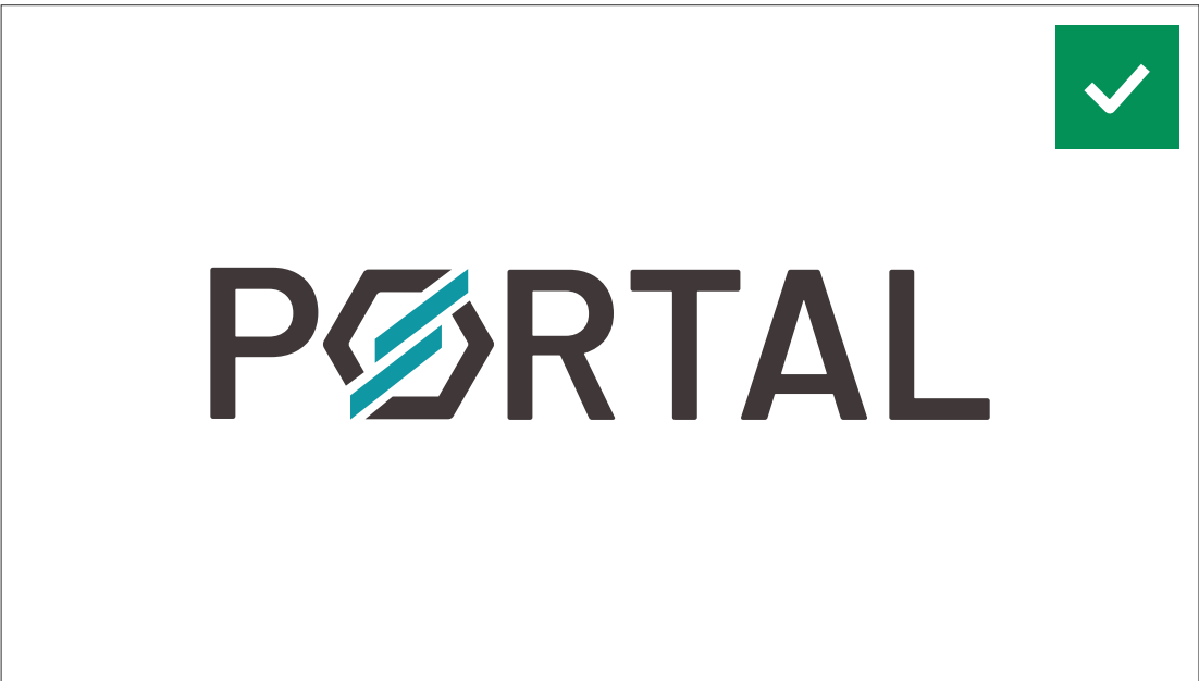
For light backgrounds