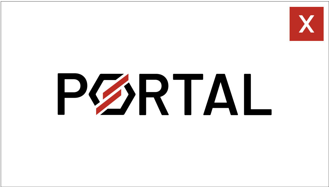
Different color or tone