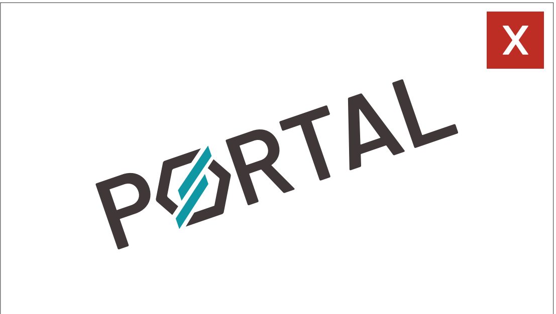
Place on angle